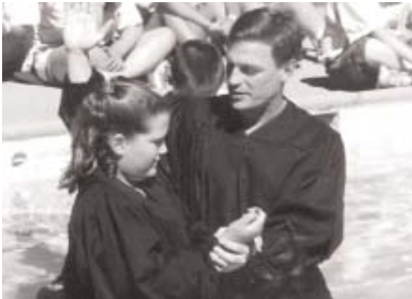
The highlight of the week was the baptism service where Pathfinders dedicated their lives to Jesus.

chance to tour the exhibit during the camporee. “I was really impressed with the way they