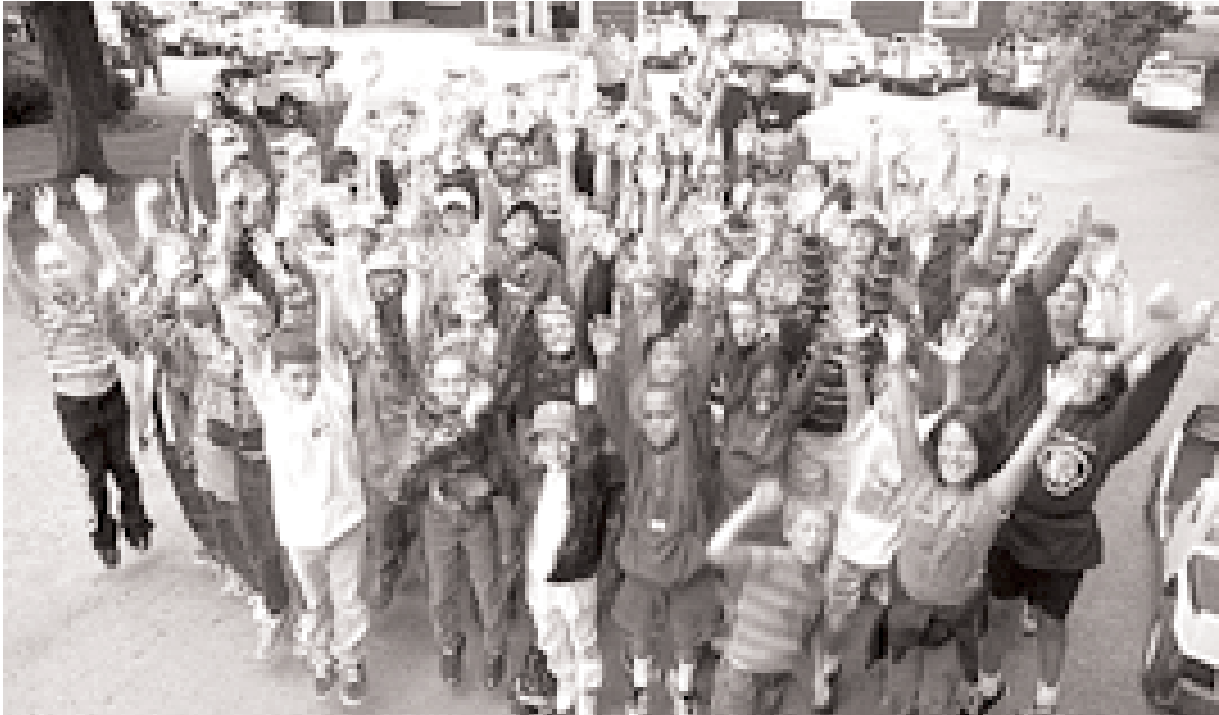
Candidates in the Discover the Power baptism class show their enthusiasm for Jesus.