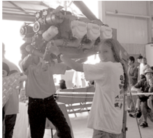
The Cessna 182 receives a new engine.

Before the camporee began, Pathfinders from the Morning Star, the Coloma Silver Foxes, and the Niles Four Flags clubs, all from Michigan, put on their oldest clothes, rubber gloves, and protective eye gear to strip paint and clean metal as the first step in a complete overhaul. AWA volunteers removed and repaired the wings, inspected the tail section, re-