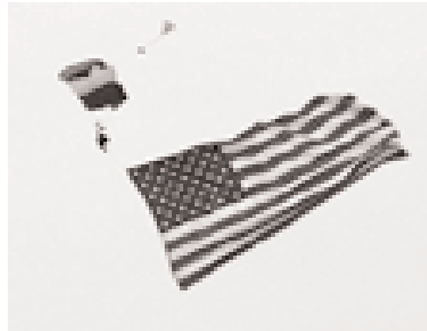
A skydiver unfurls the flag of the United States.

planes to a central location where they could show their work, share their problems, and look for solutions. In time, thousands of planes crammed the airfields at the fly-ins until, for safety and convenience, something had to be done. In 1970 the EAA found the ideal setting