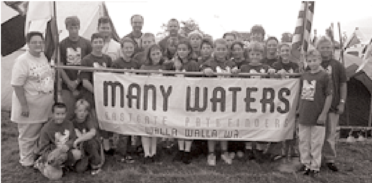
Pathfinders of the Many Waters Pathfinder Club from Walla Walla, Washington, arrived safely at Dare to Care, thanks to the generous assistance of a church member in Billings, Montana.