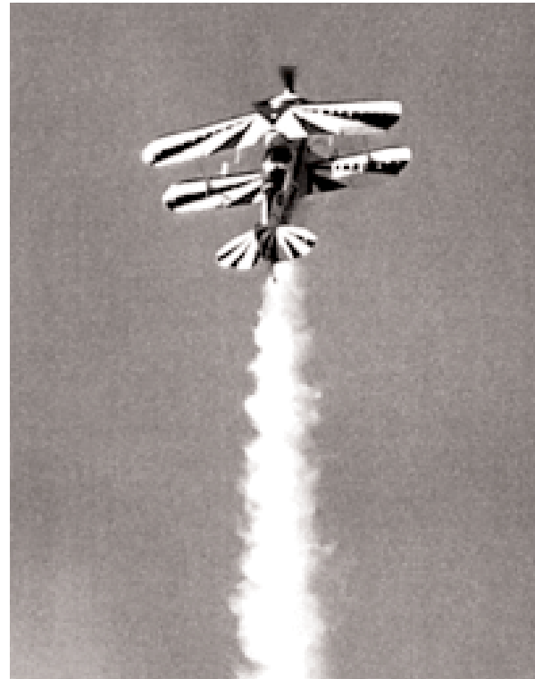
Pathfinders were treated to an acrobatic demonstration each afternoon.

Years of planning and months of hard work made the camporee a reality. It was, for all practical purposes, a city. It had its own radio station, newspaper, post office, police