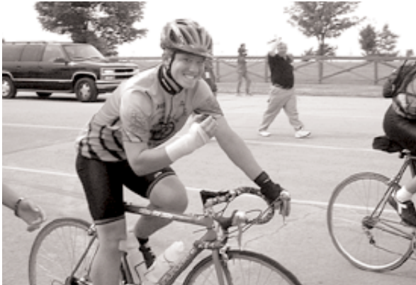
Pathfinders in the “Bike for Life: Teens Against Tobacco” road team pedaled 1,184 miles from Charlotte, North Carolina.