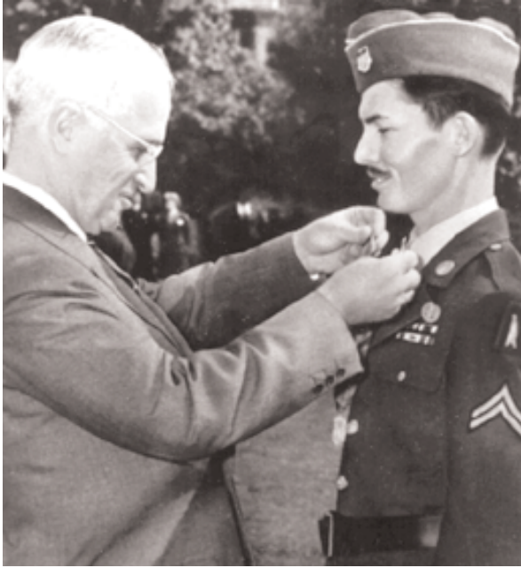
President Harry Truman presents the Congressional Medal of Honor to Desmond T. Doss on October 12, 1945.

cohost of Teen Summit, a program broadcast worldwide on Black Entertainment Television, or BET, she tackles tough issues such as drugs, family pressures, violence, and fashion. And she has a mission—to help teens make positive choices.