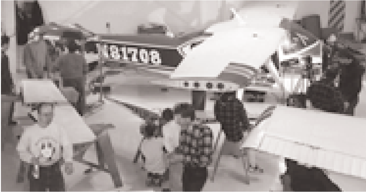
Volunteers working on Project Airpower restored and modified this Cessna 182 for mission service in Guyana. Pathfinders from the Morning Star, Coloma Silver Foxes, and the Niles Four Flags clubs, all from Michigan, assisted in the restoration.

placed control cables, installed new fuel tanks, and made special modifications to the control surfaces that allow the plane to land in small clearings. Other Pathfinders worked to sponsor “shares”—$100 contributions that helped buy the necessary parts and equipment needed to restore the plane. 8