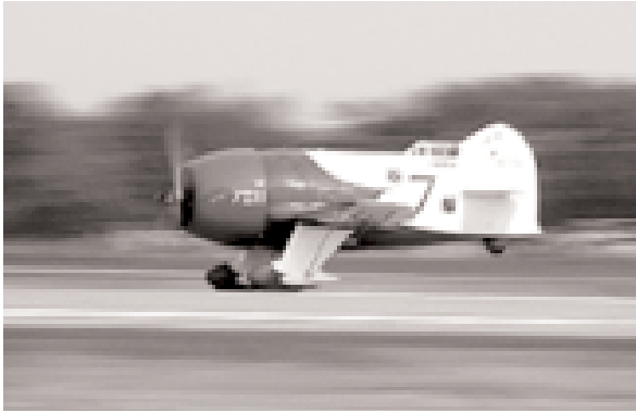
A stunt pilot roars low across the EAA airfield in a replica of the famous, and dangerous, GeeBee racer.