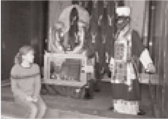
A full-size replica of the wilderness tabernacle gave Pathfinders an inside look at the foundations of their beliefs.